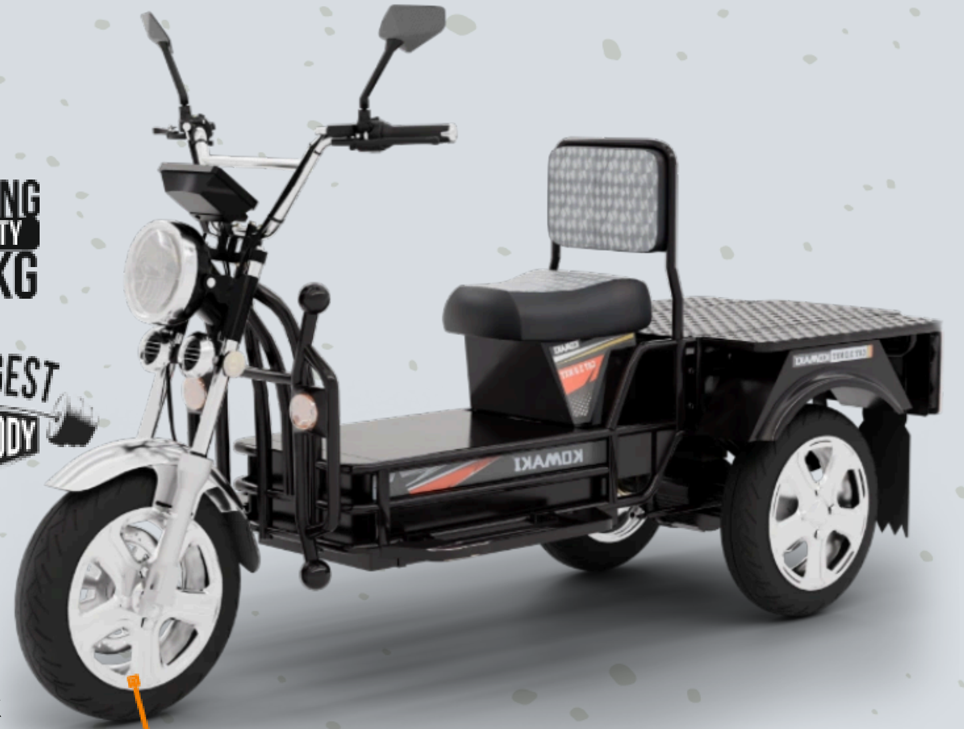
TRIPLE DISC SYSTEM

Range - 120- 200KM Meter - Digital Screen Back Platform Size - 4X4 Foot Space - Wide Space Front Suspension - Telescopic Shock Absorber Rear Suspension - Hydraulic Shock Absorber